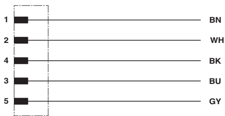
Contact assignment of the M12 plug