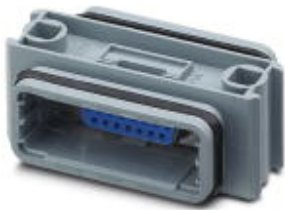
D-SUB coupling, shell size 2, socket, gender changer, shielded, connection direction straight, IP67 degree of protection

Please be informed that the data shown in this PDF Document is generated from our Online Catalog. Please find the complete data in the user's documentation. Our General Terms of Use for Downloads are valid ( http://download.phoenixcontact.com )